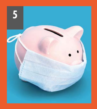
Tips to Protect Your Investment During a Major Crisis